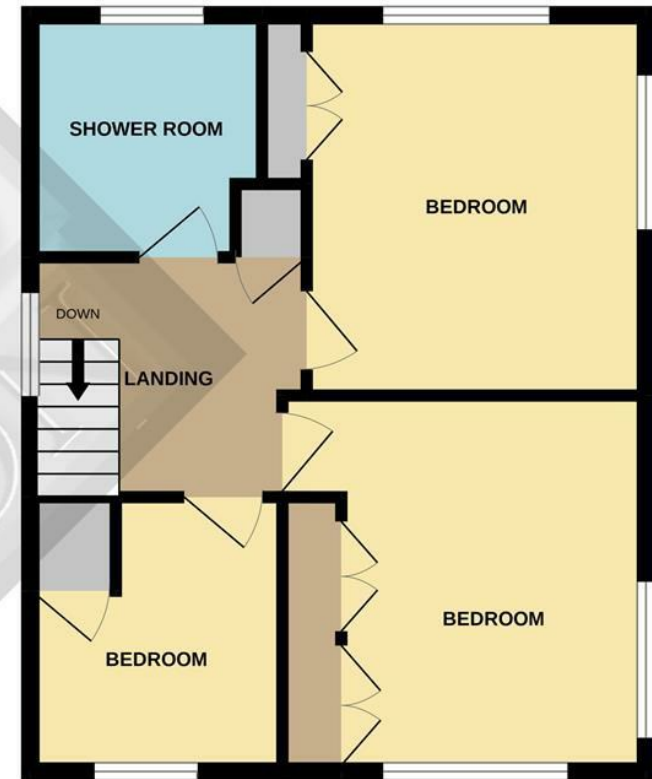
1ST FLOOR 474 sq.ft. (44.0 sq.m.) approx.